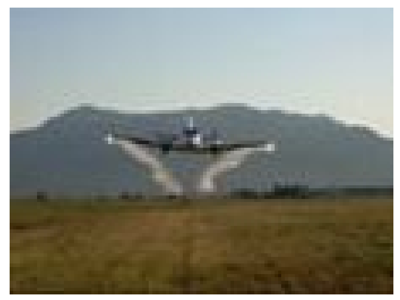
Dynamic Aviation Coming Soon to a Neighborhood Near You